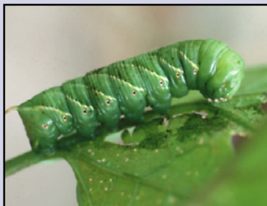
Tomato Horn Worm