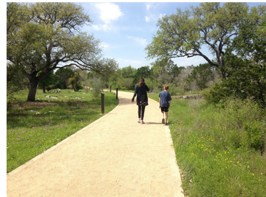
1/2 MILE LOOP TRAIL