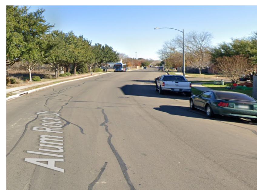
EXISTING STREET PARKING