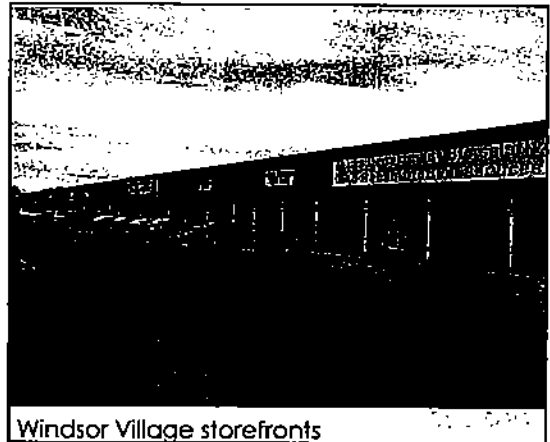
Windsor Village storefronts

Objectives and recommendations in this section expand upon the University Hills/ Windsor Park Neighborhood Plan goal: "Attract needed vendors and service providers into the planning area through support for local businesses, and encourage revitalization/redevelopment of neighborhood shopping areas." At most of the neighborhood planning meetings, stakeholders expressed their concerns about the lack of some services in the area (e.g., local restaurants, shops, entertainment, etc.). Additionally, they stated that they wanted to be able to walk or ride a bike to these types of services.