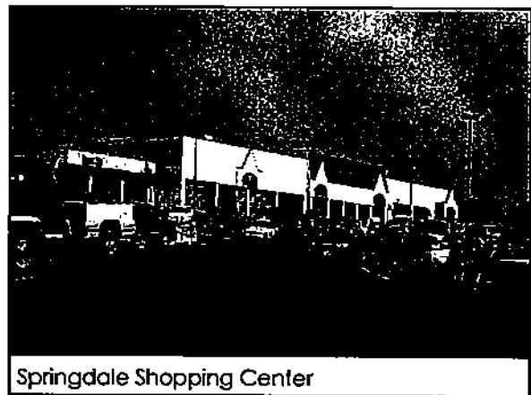
Springdale Shopping Center

Neighborhood planners met with Economic Growth and Redevelopment Services Office (EGRSO) staff members on October 29, 2006, to discuss strategies to achieve the objectives described in this chapter. EGRSO staff recommended the coordination of a "round-table" discussion where developers, retailers, and real estate professionals can provide insight regarding effective strategies for attracting desired retail and service providers into the planning area. They could also discuss strategies to initiate the redevelopment and revitalization of area shopping centers. Round table participants could create a plan for advancing the recommendations described in this section.