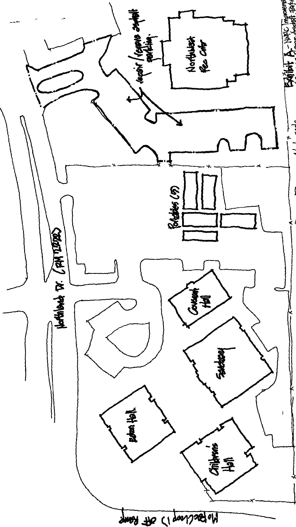
Exhibit A - NWPC Implementation (Refer to Repair / Reserve asphalt parking) Cemetery Reconstruction Plan Jackson County Association, File 2/13/07