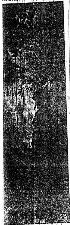
ists and make room for king with ground forces.