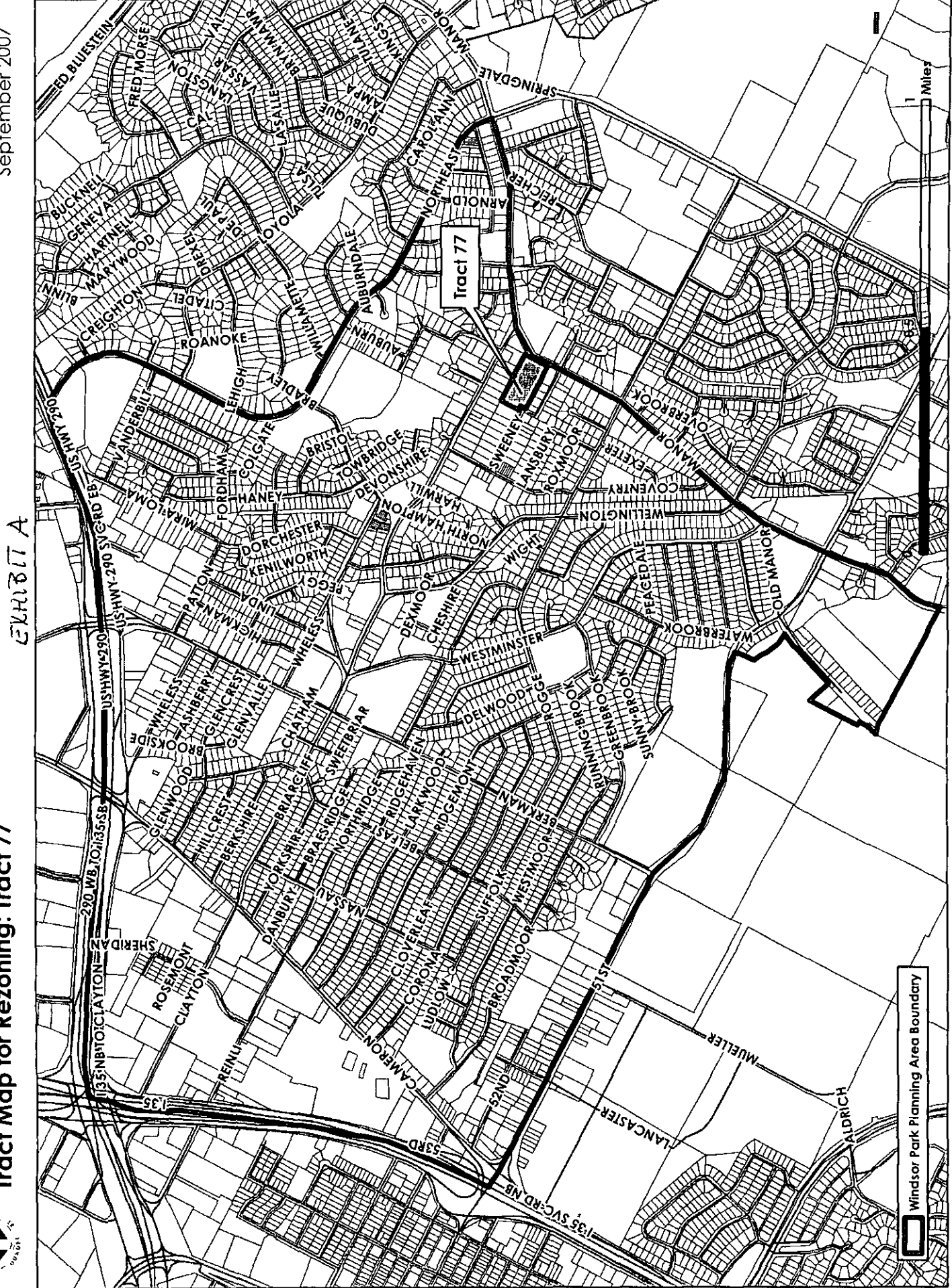
Windsor Park Neighborhood Plan Combining District Tract Map for Rezoning: Tract 77