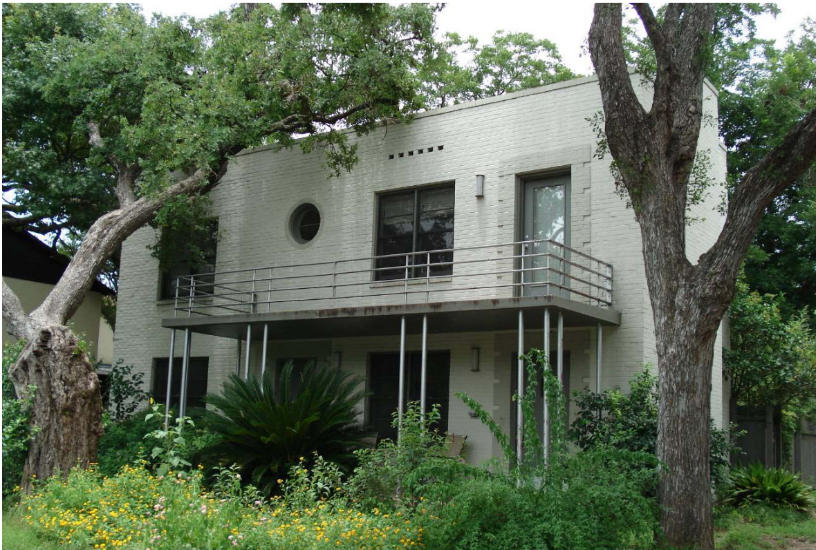
1206 Lorrain Street ca. 1940