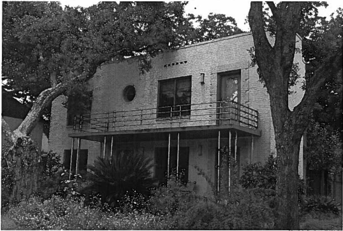
1206 Lorrain Street ca. 1940