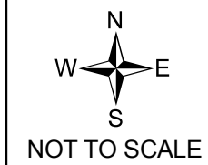
FIGURE 2 - ENLARGED PLAN AT CREEK CROSSING