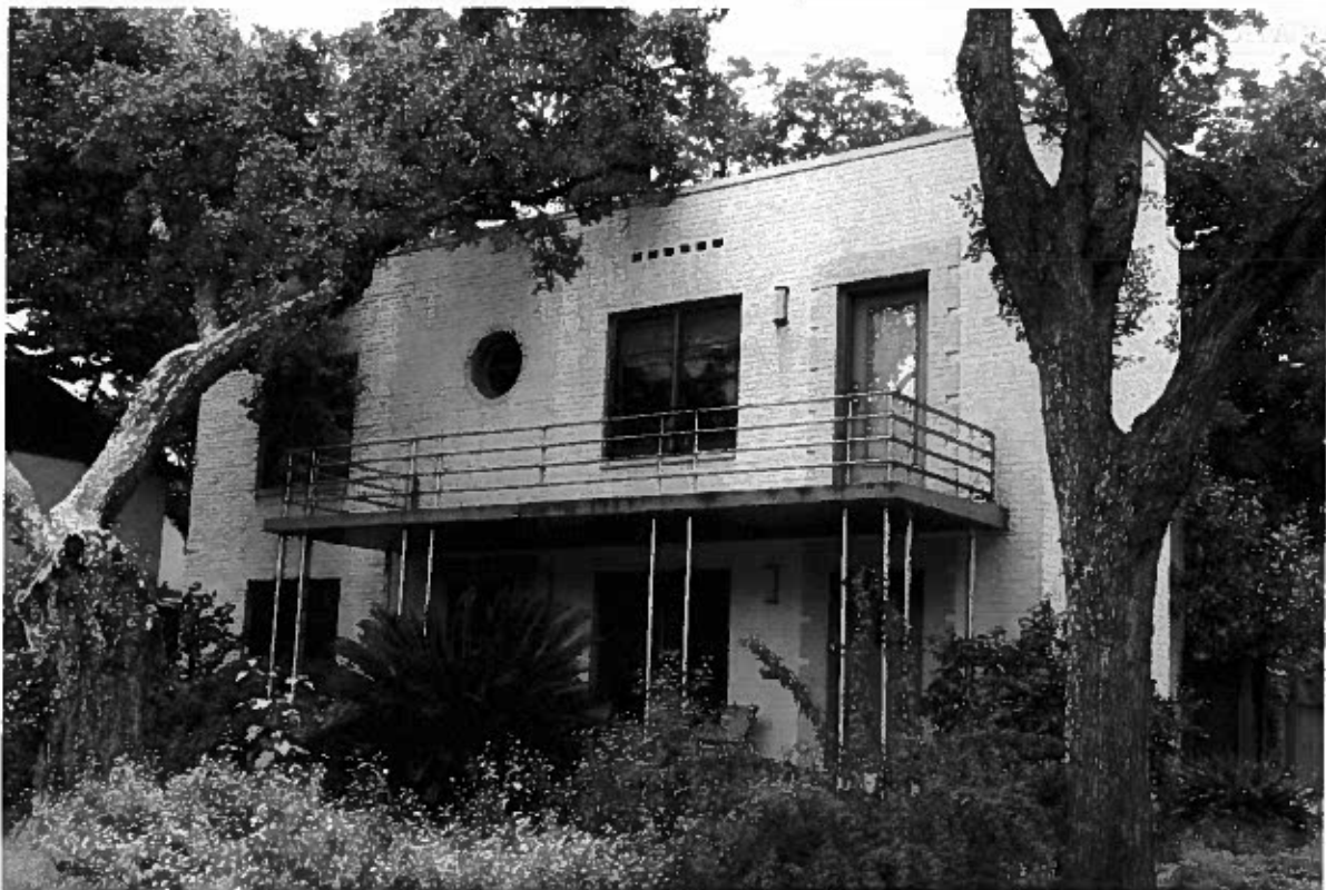
1206 Lorrain Street ca. 1940