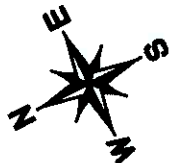
EXHIBIT "B" SKETCH TO ACCOMPANY FIELD NOTE DESCRIPTION OF A 4.353 ACRE ACCESS EASEMENT BEING OUT OF AND A PART OF LOT 2, BLOCK "C" MARSHALL HILLS SECTION TWO BOOK 76, PAGE 279 IN THE CITY OF AUSTIN, TRAVIS COUNTY, TEXAS