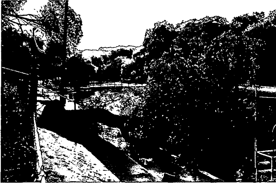
Tree failure at the pool