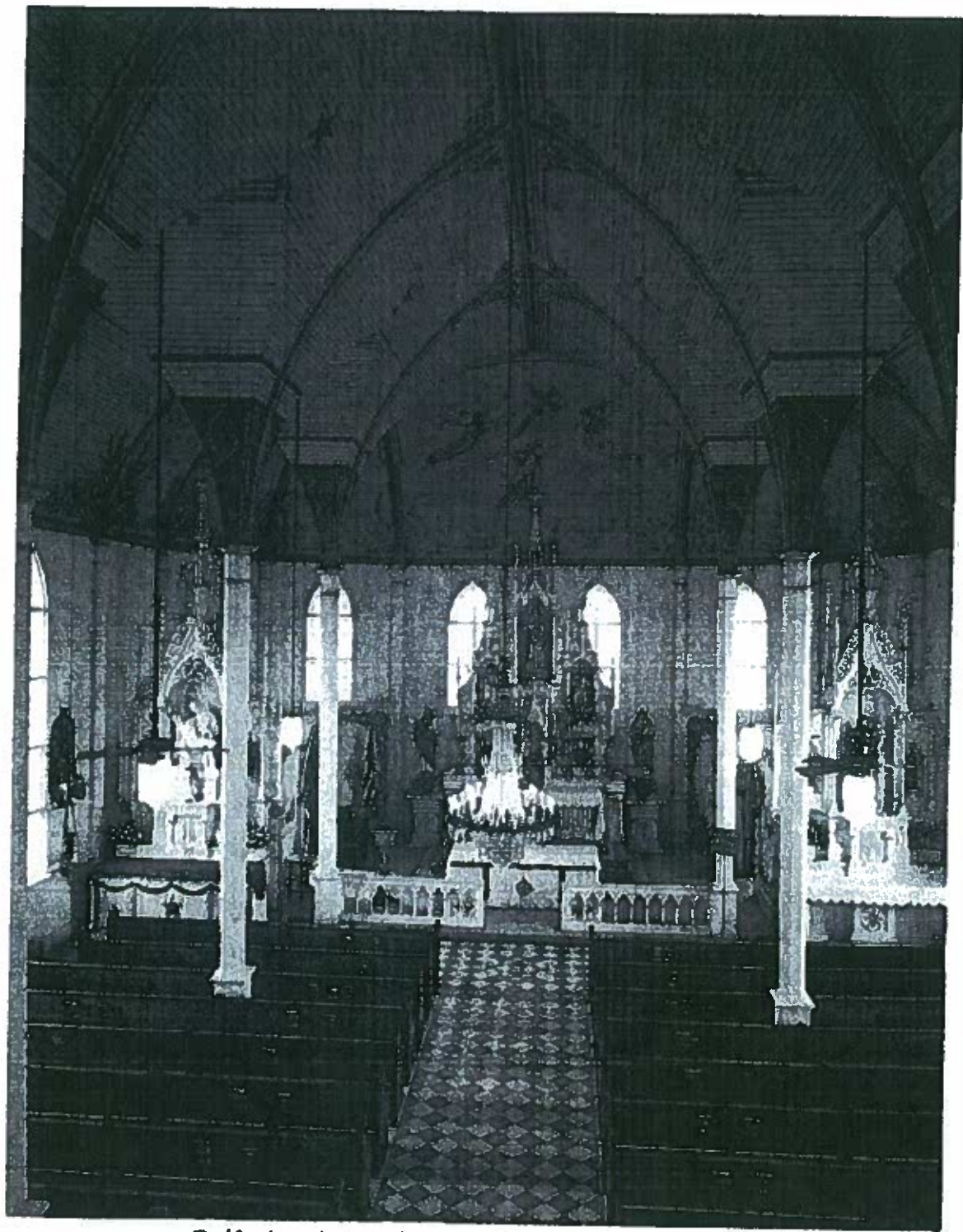
Godfrey's artistic work, painted in 1895, in Praha church.