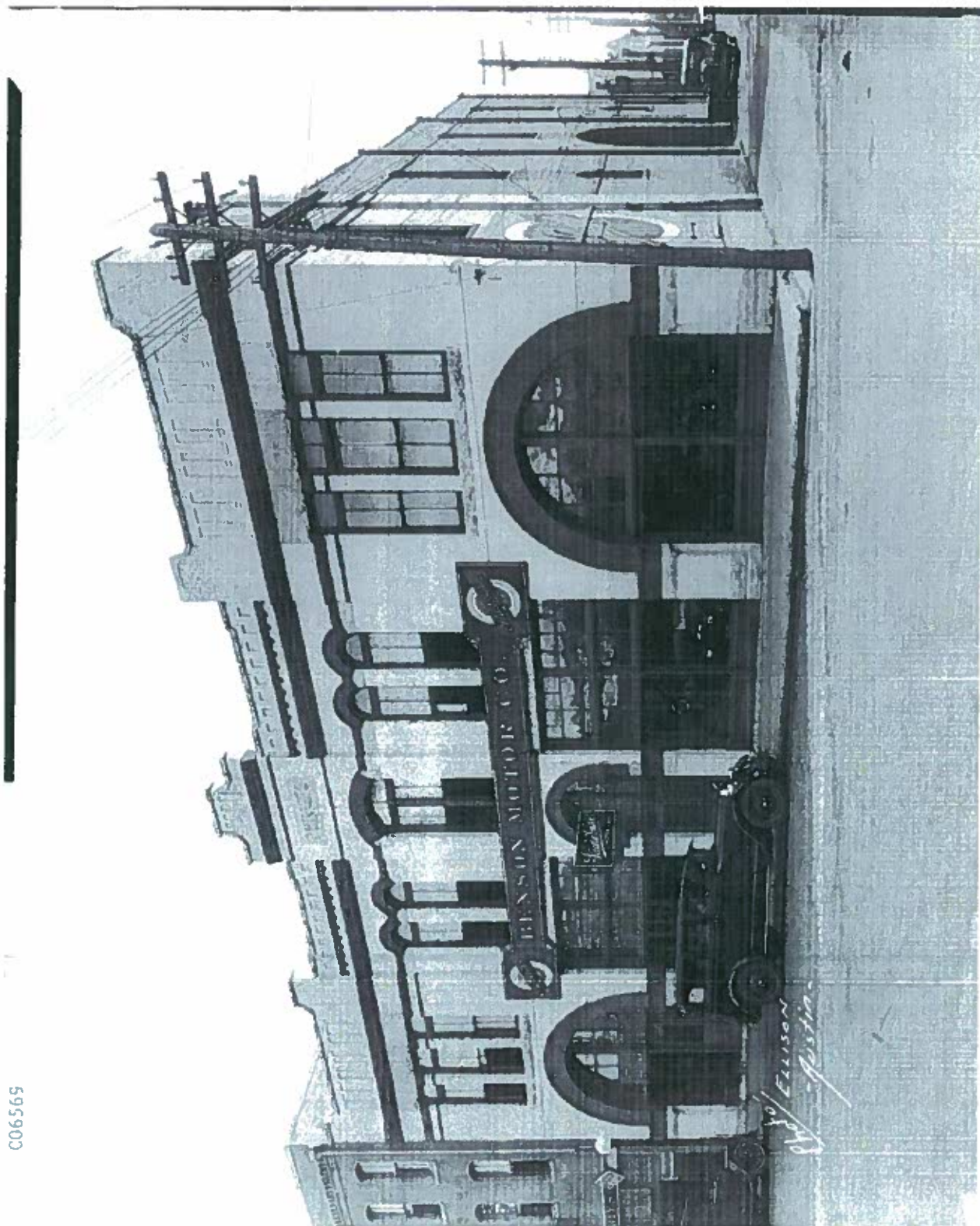
Photograph of the Benson Motor Company, 111-15 E. 5 th Street (ca. 1933)