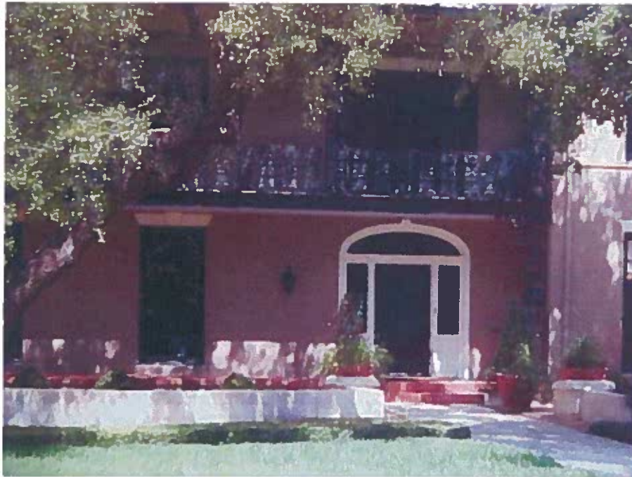
Detail of front entry and ornamental metal balcony railing