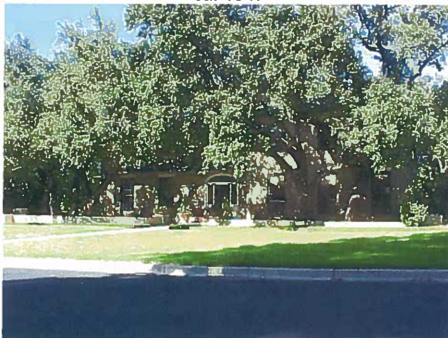
12 Niles Road ca. 1947