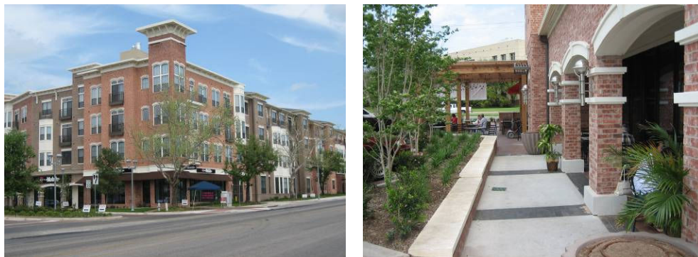
The Triangle, located at the intersection of North Lamar Boulevard and Guadalupe Street, was cited by stakeholders as the example of mixed use development to be used for the redevelopment of the portion of North Lamar Boulevard that runs along the NLCNPA. A good mixture of local-serving restaurants and stores (right) are built beneath residential units in the Triangle development.

To enhance this segment of North Lamar Boulevard, neighborhood stakeholders determined that it should become a mixed use corridor providing a variety of residential and non-residential uses. The term “mixed use” means a mixture of both residential and commercial uses within a particular area or site. This mix usually occurs within the same structure but is not always required.