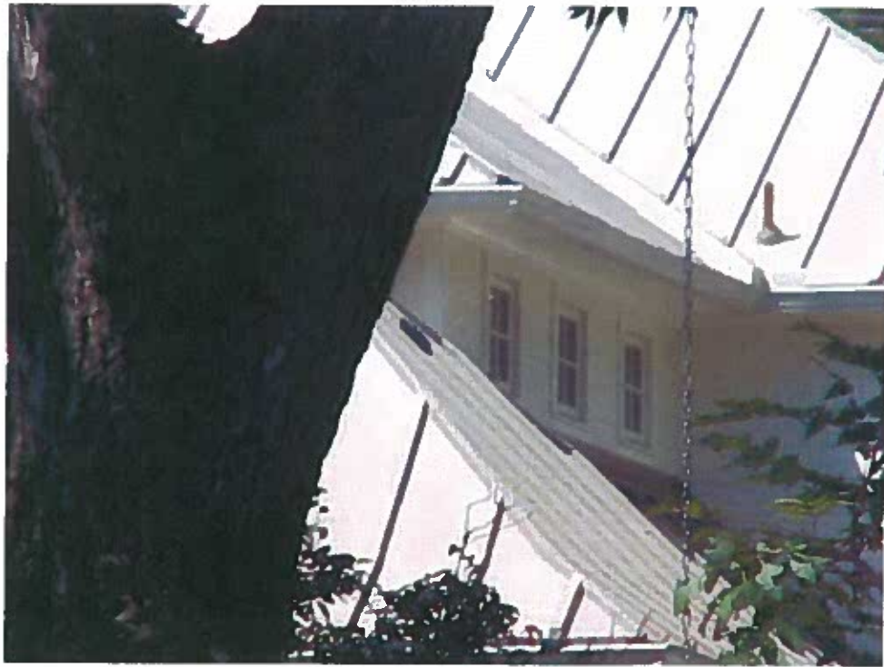
Detail of addition