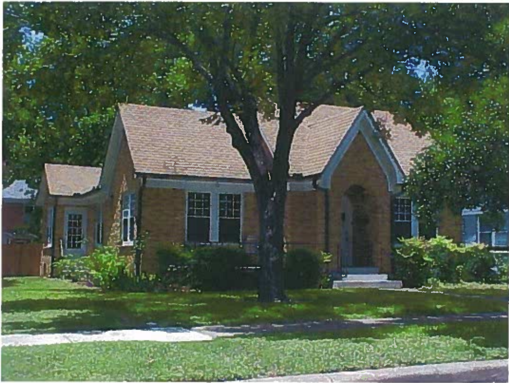
Olson-Foster House 3808 Avenue H ca. 1934