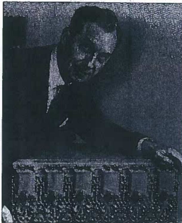
Harwell Hamilton Harris achieved international acclaim during the '50s as a maker of houses whose innovations trickled down into ordinary neighborhoods throughout the country.