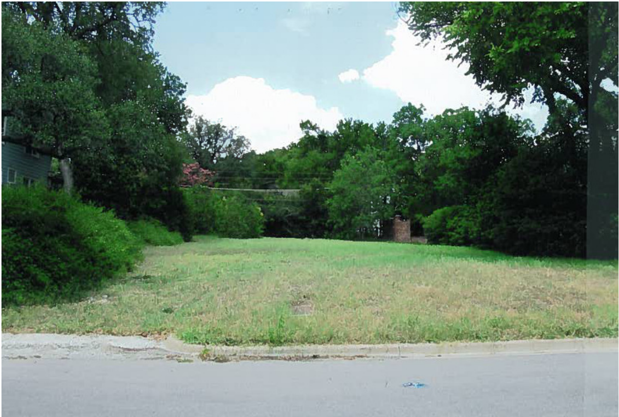
1600 Ethridge Avenue