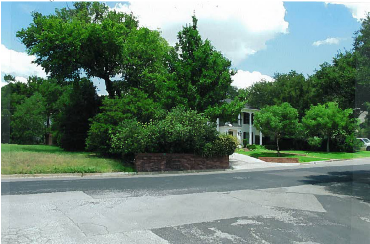
View of adjacent building