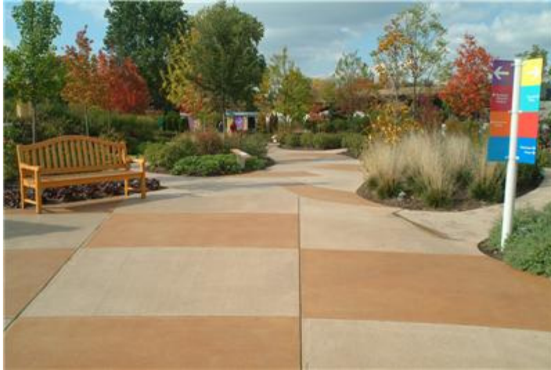
Integral colored concrete