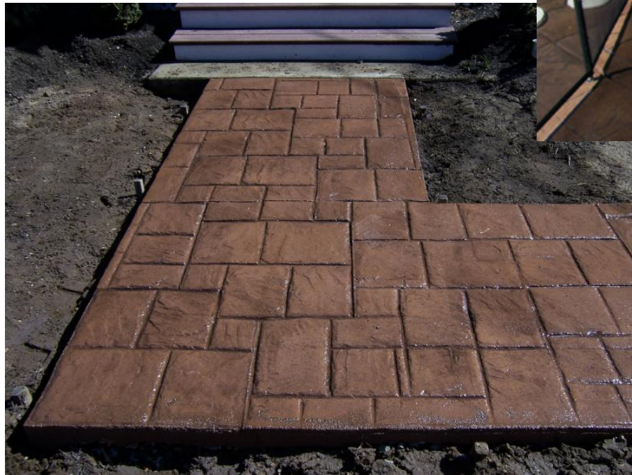
Stamped colored concrete