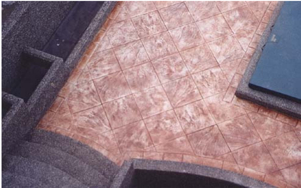
Stamped colored concrete