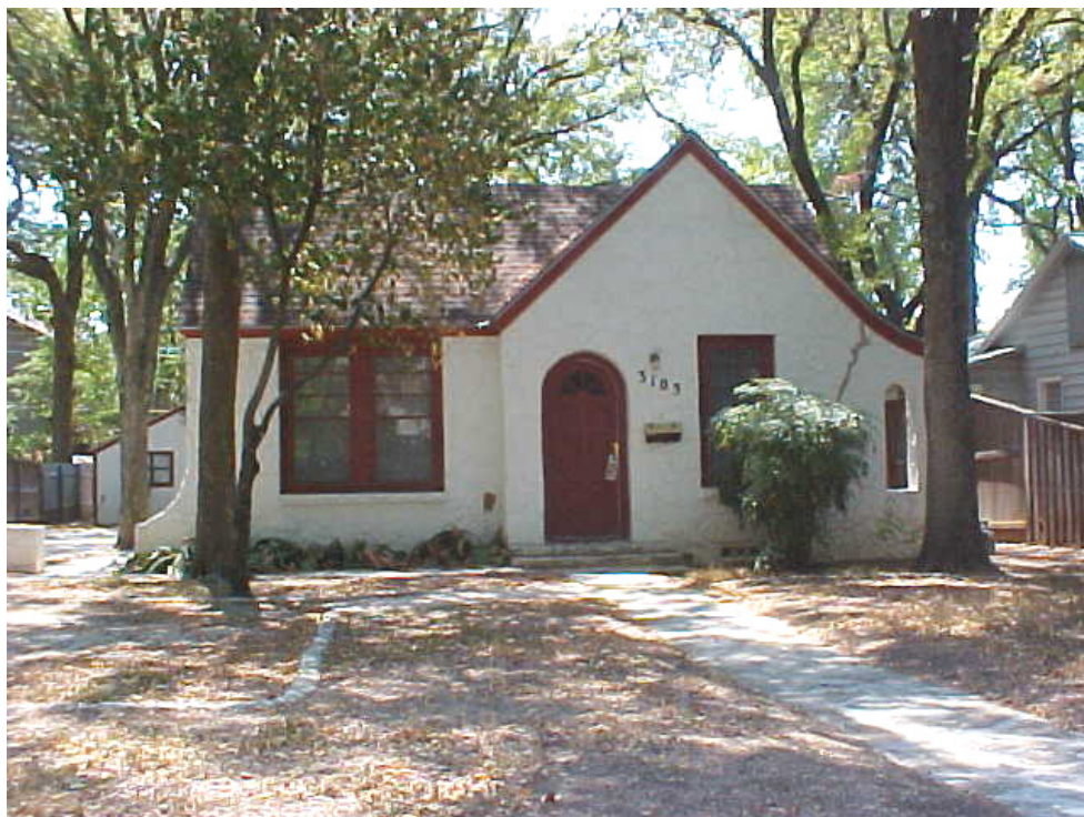
3103 Bonnie Road ca. 1939