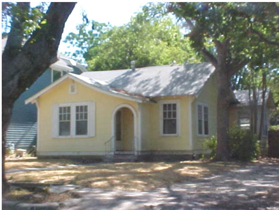
4107 Rosedale Avenue ca. 1937