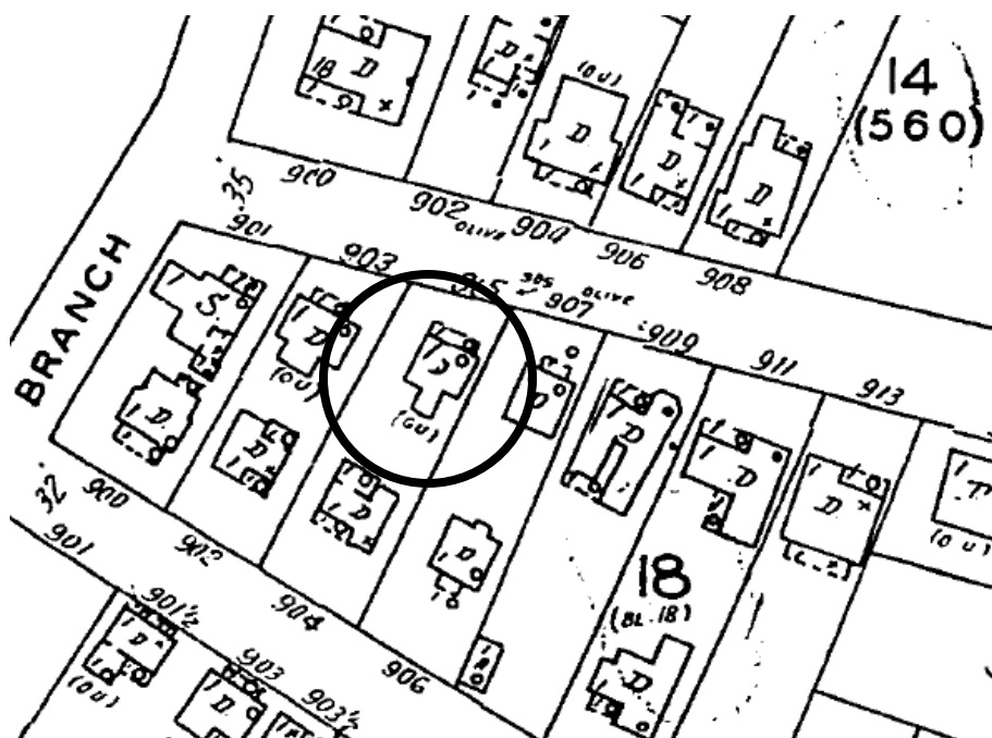
The 1962 Sanborn map shows the house.