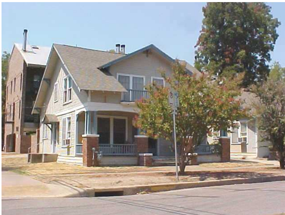
1700 San Antonio Street ca. 1927