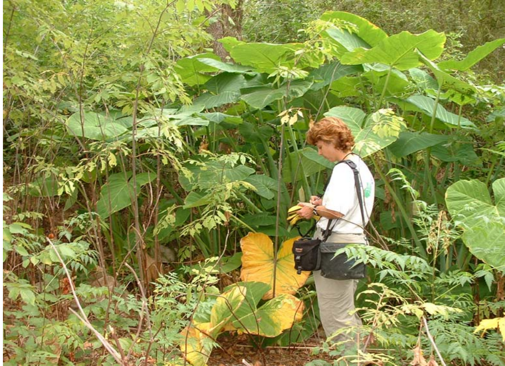
Oak Spring 3. Large elephant ears dominate the discharge point. WPDRD staff Sylvia Pope in photo.