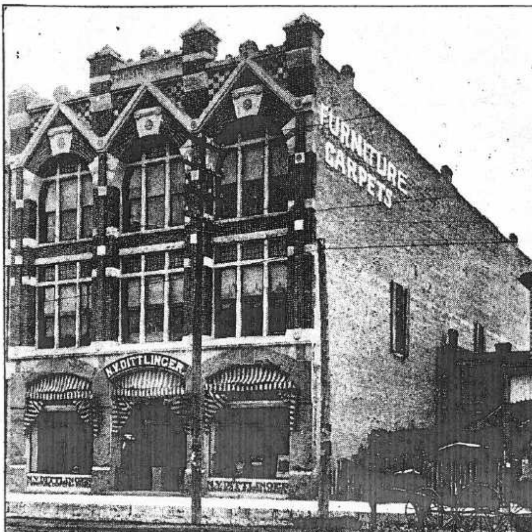
The 1894 photograph of the building shows the paint scheme of dark sashes with light trim on the upper floors of the building and an undetermined color for the trim on the first floor.