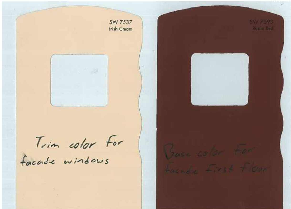
Paint colors proposed for the building.