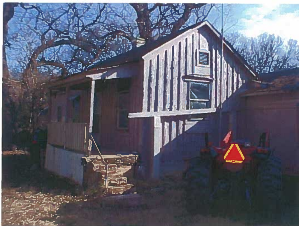
623 Wood Street