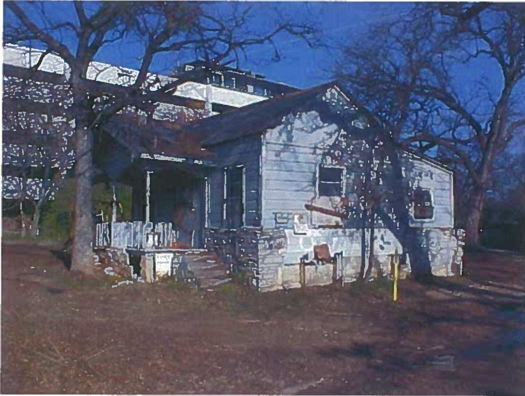
702 Wood Street