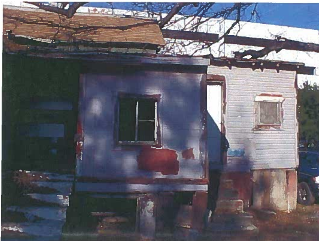
Rear of 623 Wood Street