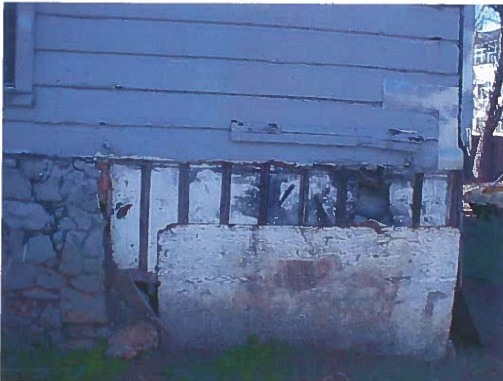
702 Wood Street, showing the board-and-batten siding underneath the modern siding.