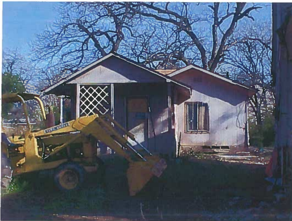
623 Wood Street