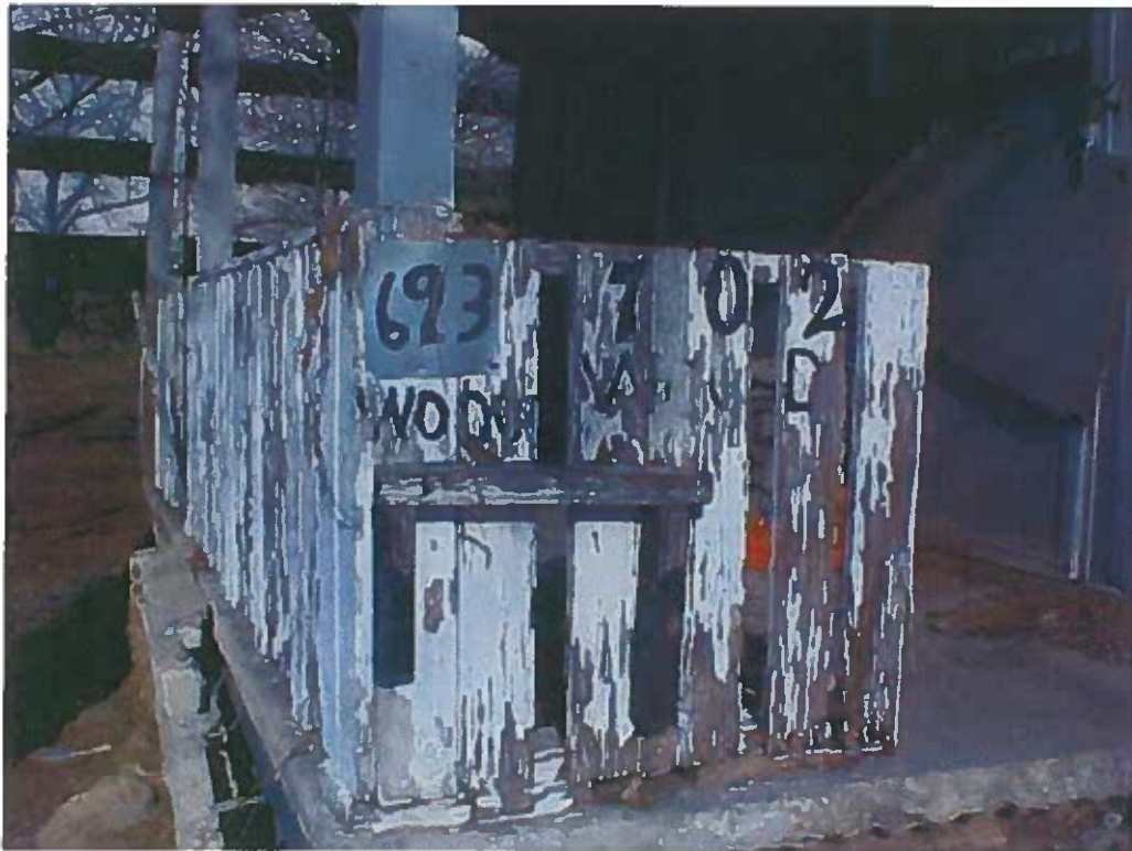
Front porch of 702 Wood Street showing both addresses