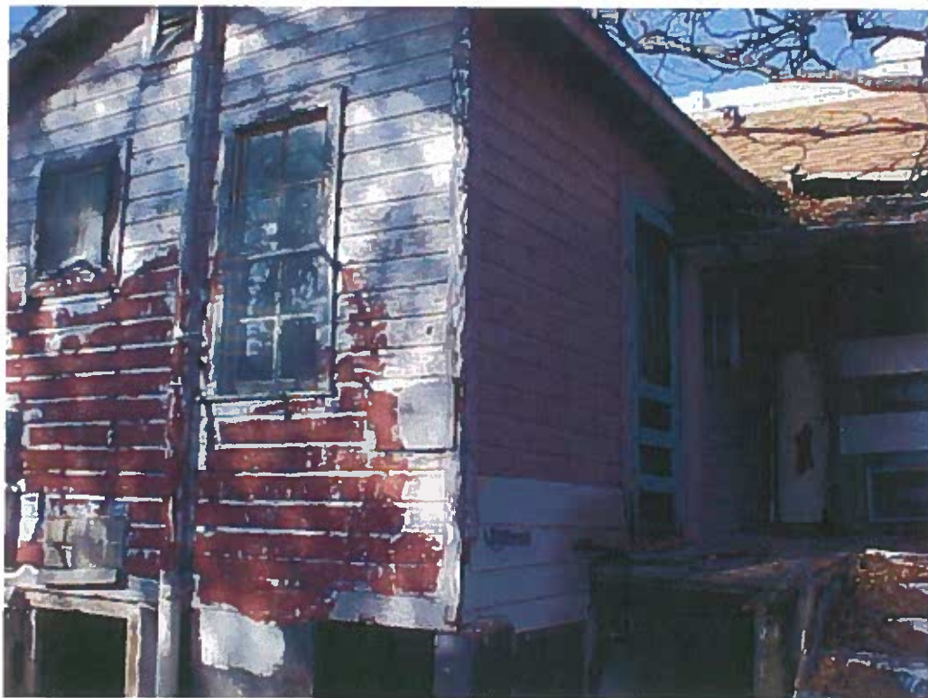
623 Wood Street (rear)