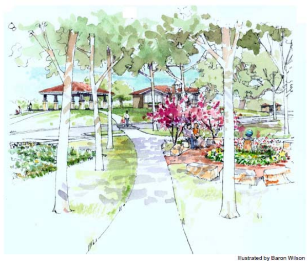
OPTION #1B TOTAL RESTORATION/RECONSTRUCTION OF NORWOOD ESTATE WITH ADDITIONAL FACILITIES