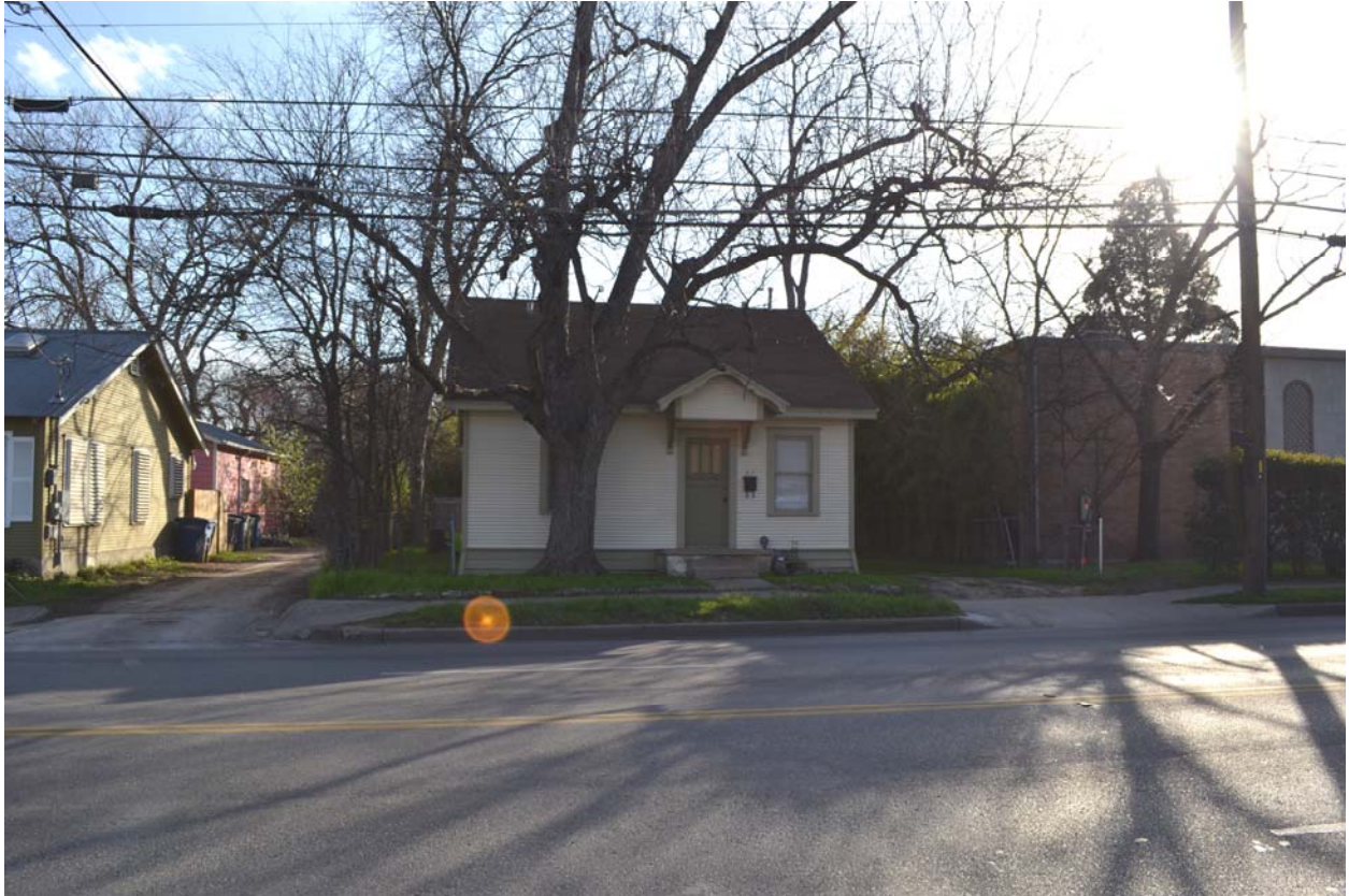
Front elevation of 307 W. 45 th Street