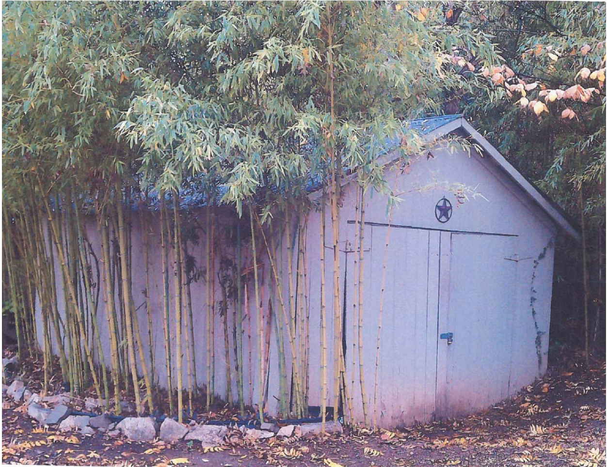
Existing detached garage to be demolished.