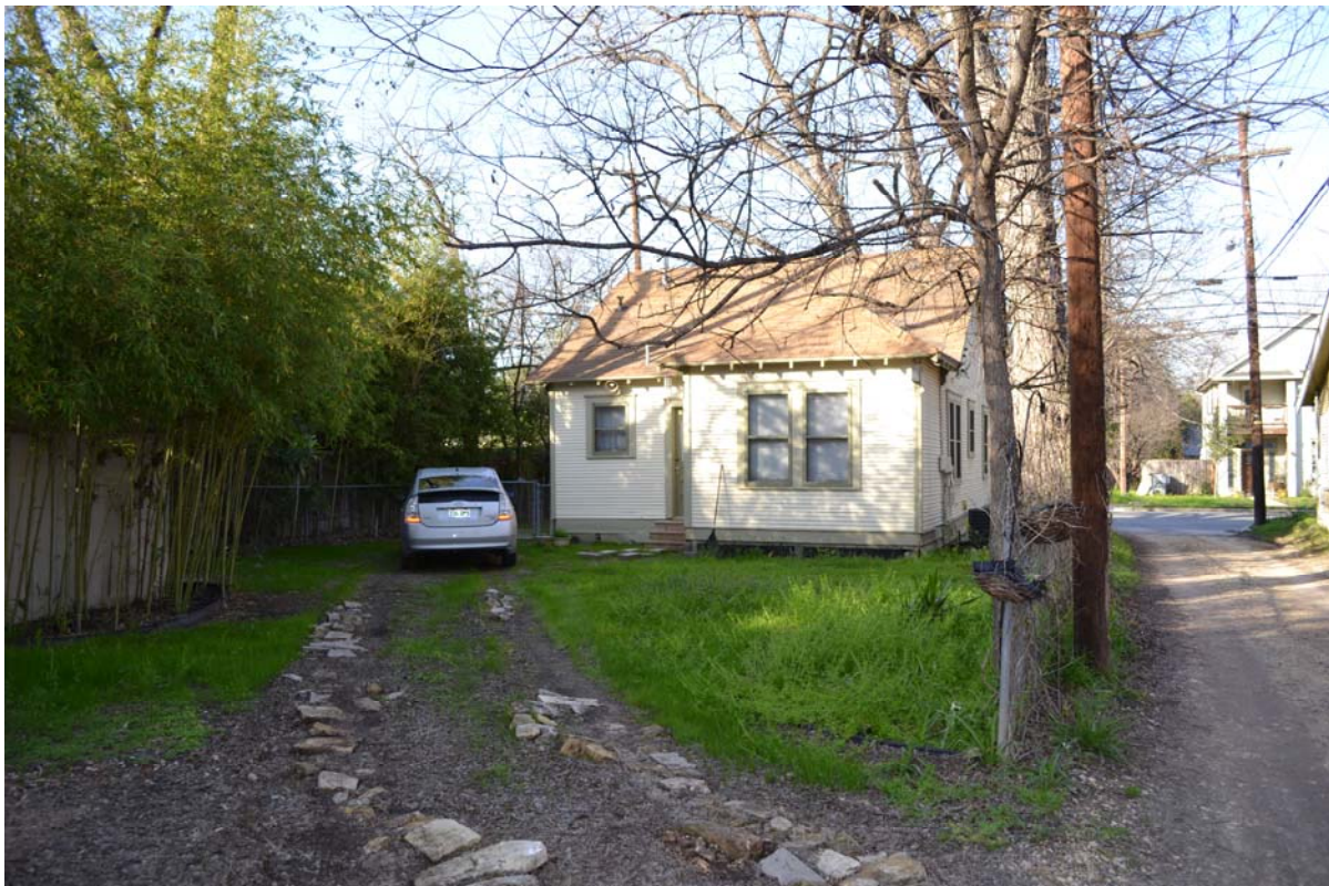
Rear elevation and yard of 307 W. 45 th Street