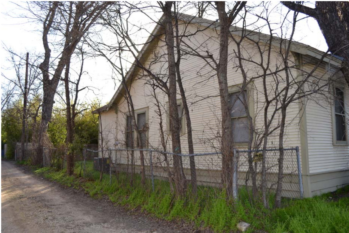
Side (alley) elevation of 307 W. 45 th Street