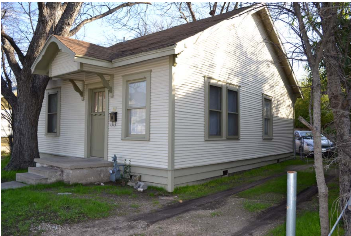
Front and side elevation of 307 W. 45 th Street