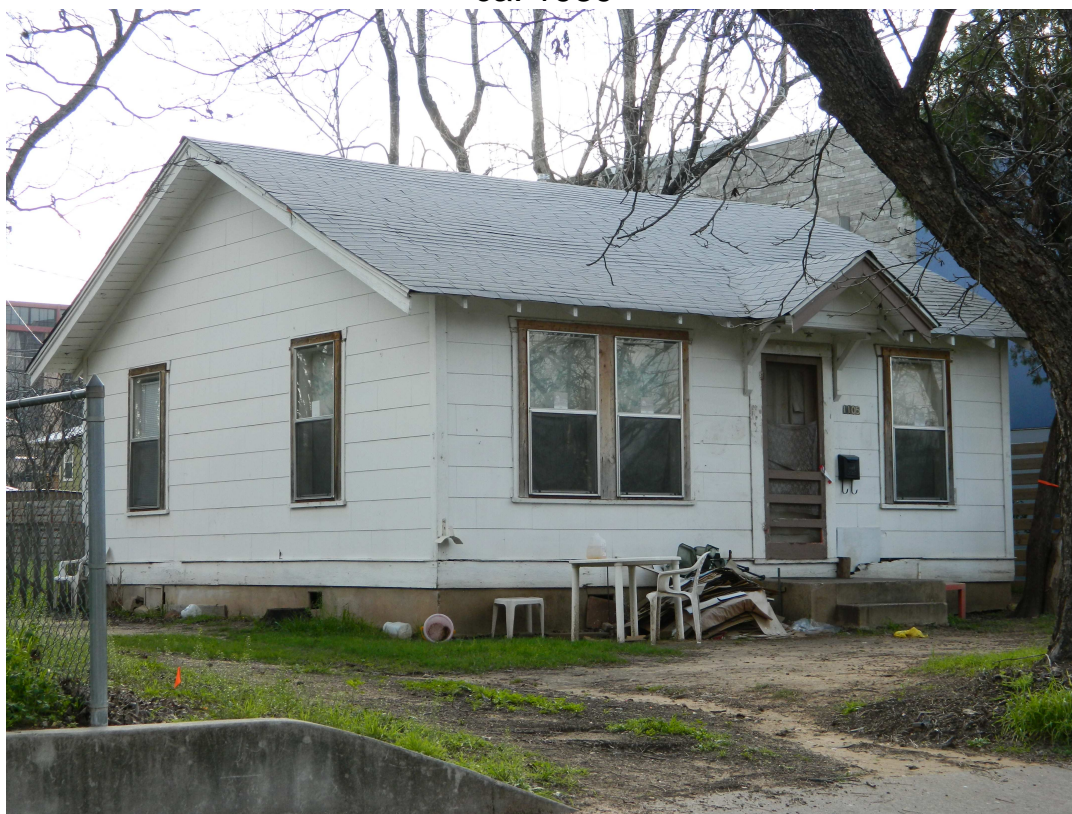
1105 Lambie Street ca. 1939