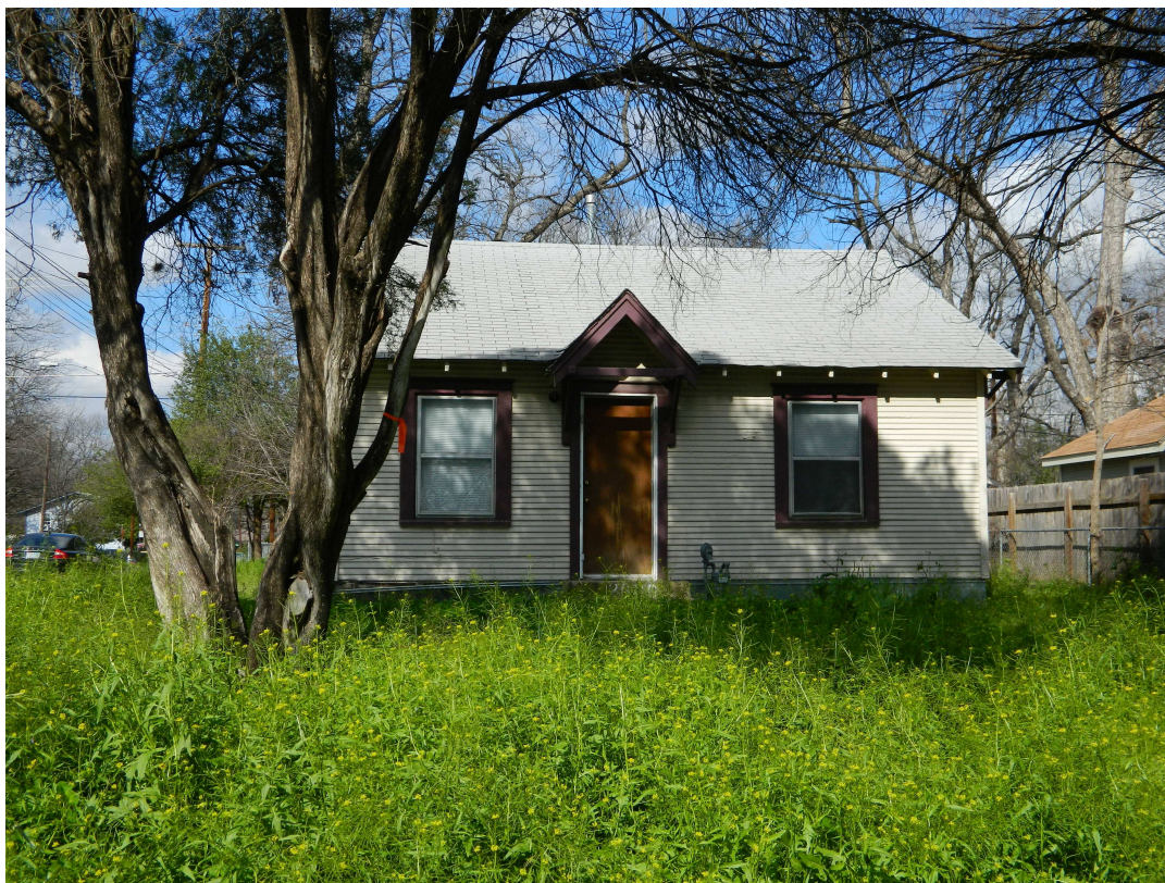
2600 Canterbury Street ca. 1937