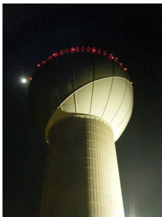
51st Street Tower

Using an FY 2003 appropriation of $275,000 and in-kind services from AWU staff, the City of Austin and the Bureau of Reclamation finalized, with a favorable recommendation, a required Feasibility Study for the City's participation in the Title XVI Water Reclamation Program. The City appreciates the delegation's support of that appropriation and for this project in general.