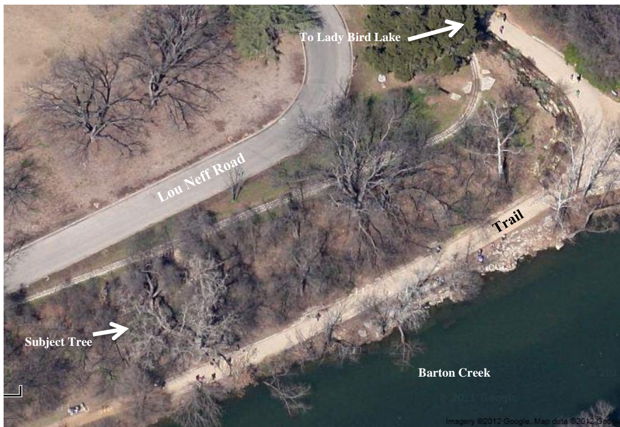
FIGURE 2: Aerial view of subject tree and site.