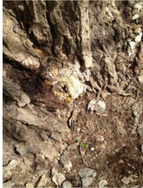
FIGURE 6: Fungal fruiting structure at tree base.