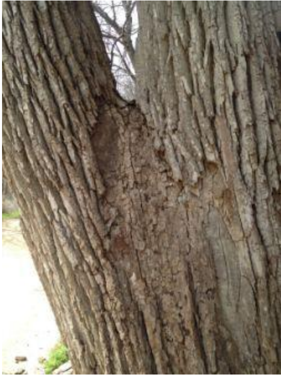
FIGURE 5: Detail of crotch at codominant stem.