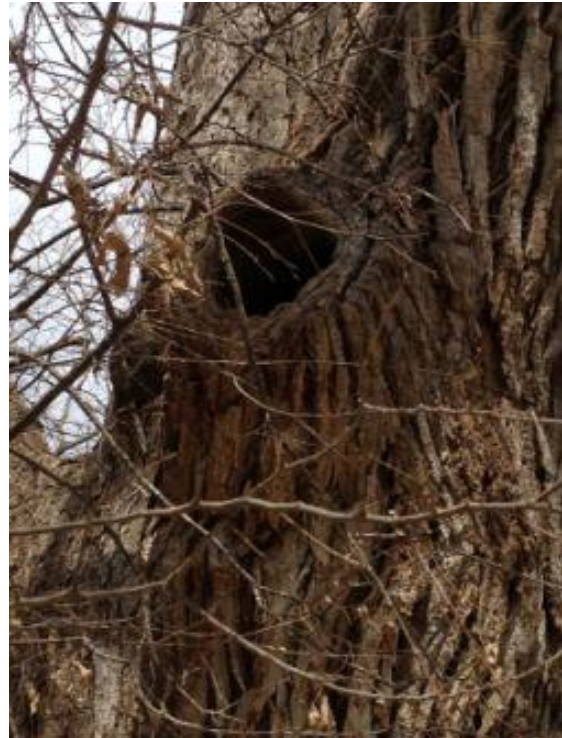
FIGURE 4: Example of decay cavity visible in tree.