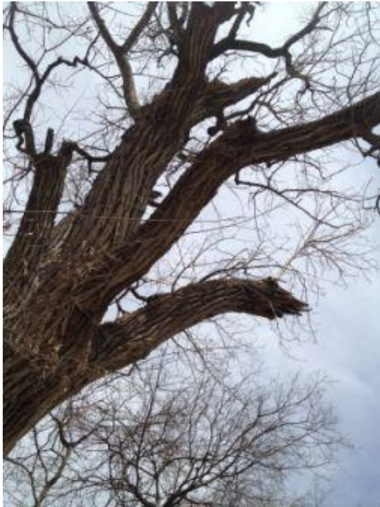
FIGURE 3: Multiple stubs show evidence of previous failures.

This cottonwood is a very mature tree and quite large at 65 inches DBH, 75 feet in height, and a canopy spread of 50 feet. Seven broken stubs appear in the canopy, indicating past limb failures. Cavities at old wounds are visible in various locations in the crown. The main stem 2 bifurcates at eight feet into codominant stems of approximately 33 inches diameter each. Some bark disturbance appears near the crotch, possibly from an old wound, and evidence of borer activity is visible in this area and elsewhere on the main stem. The tree leans 25-30 degrees over the recreational trail. A fungal fruiting structure is visible at the tree's base. The root collar is exposed. Figures 3-6 show examples of defects in this tree.