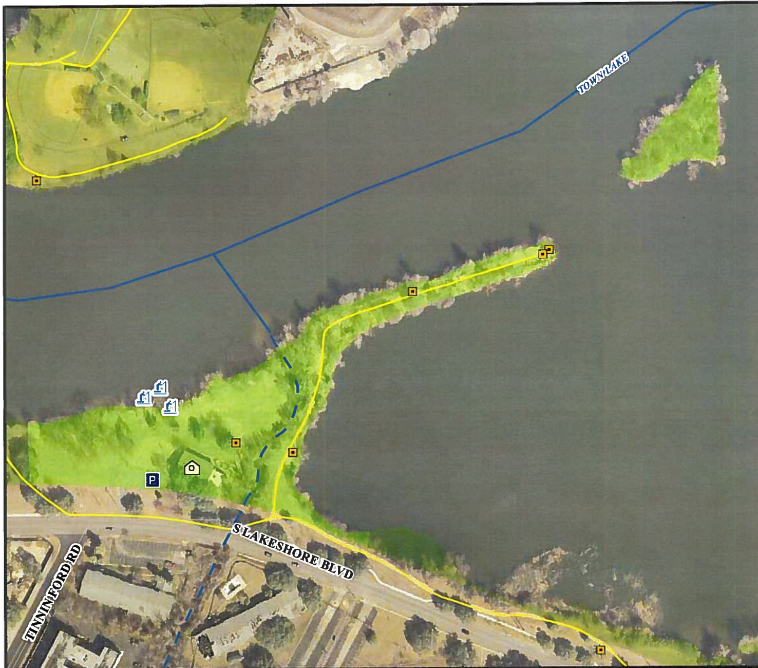
Peace Point at Town Lake Metro Park