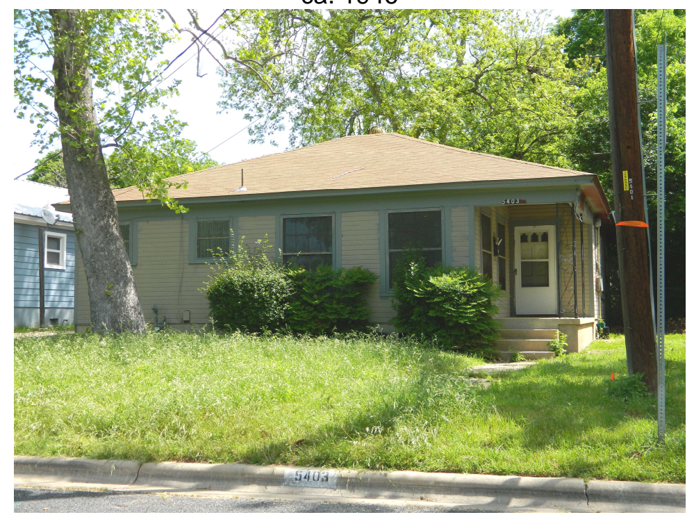
5403 Shoalwood Avenue ca. 1946