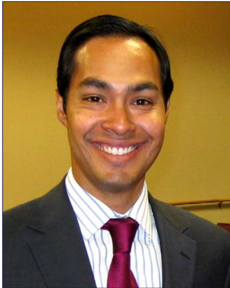
Julian Castro