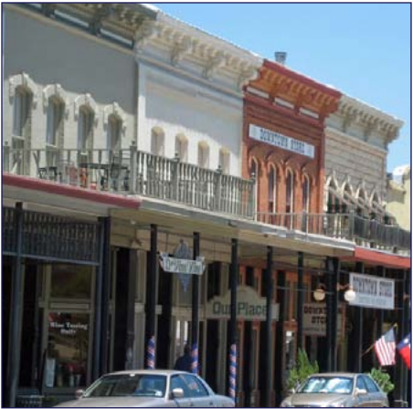
Granbury, Texas

have seen first-hand the real human impact of these harmful loans.