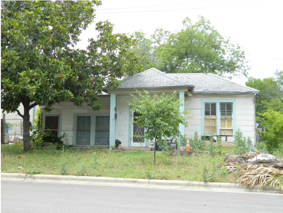
4914 Bennett Avenue ca. 1928