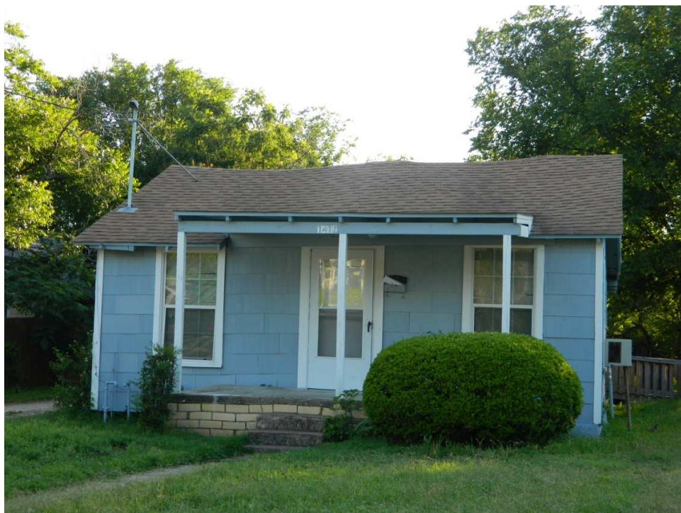
1412 Harvey Street ca. 1948