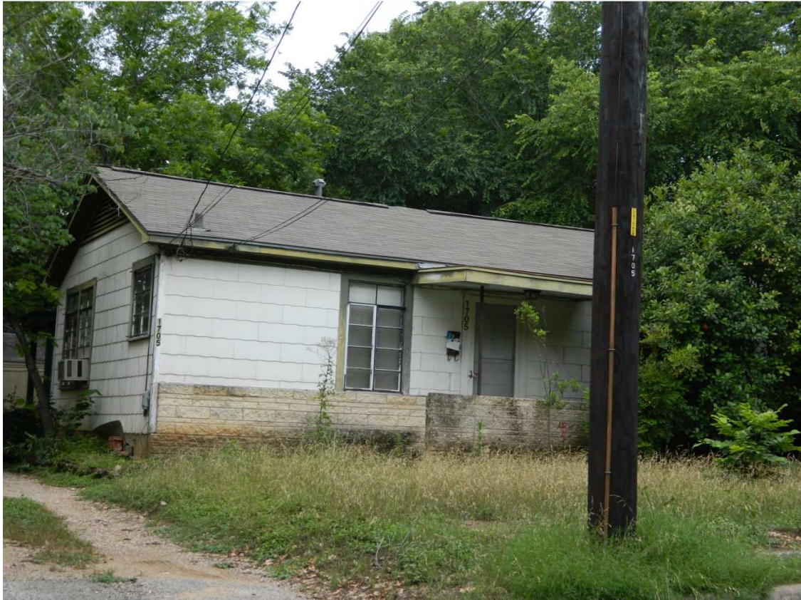
1705 Dexter Street ca. 1948