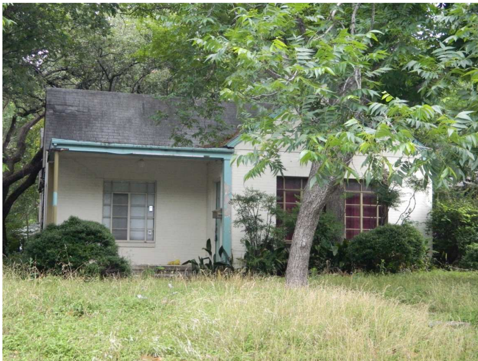
1703 Dexter Street ca. 1938