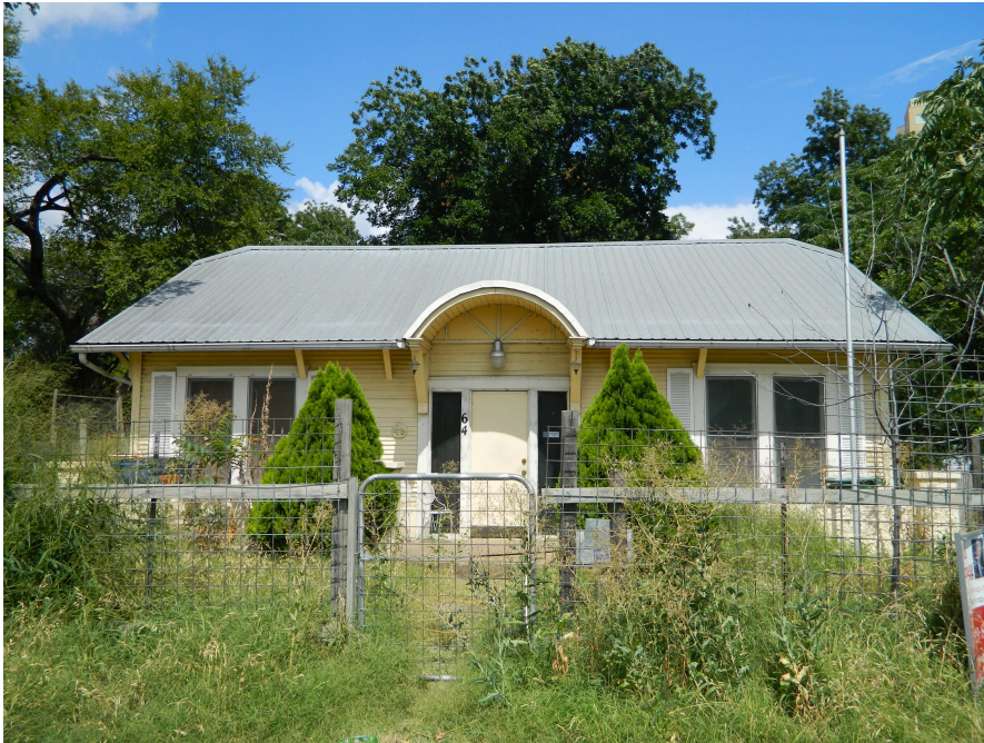
64 East Avenue ca. 1923