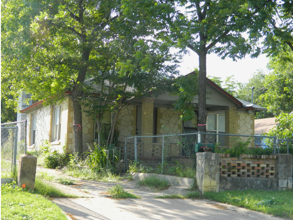
2212 S. 3 rd Street ca. 1946