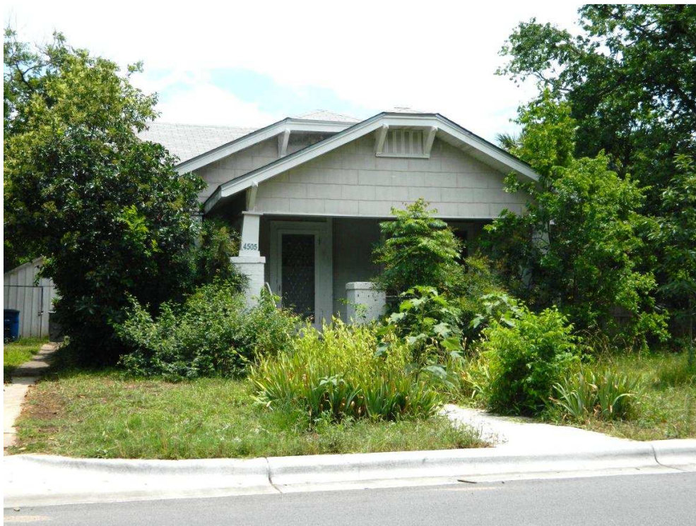
4505 Red River Street ca. 1932