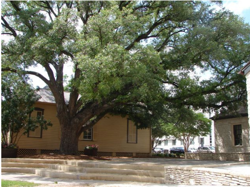
Original Grade Before Courtyard Installation