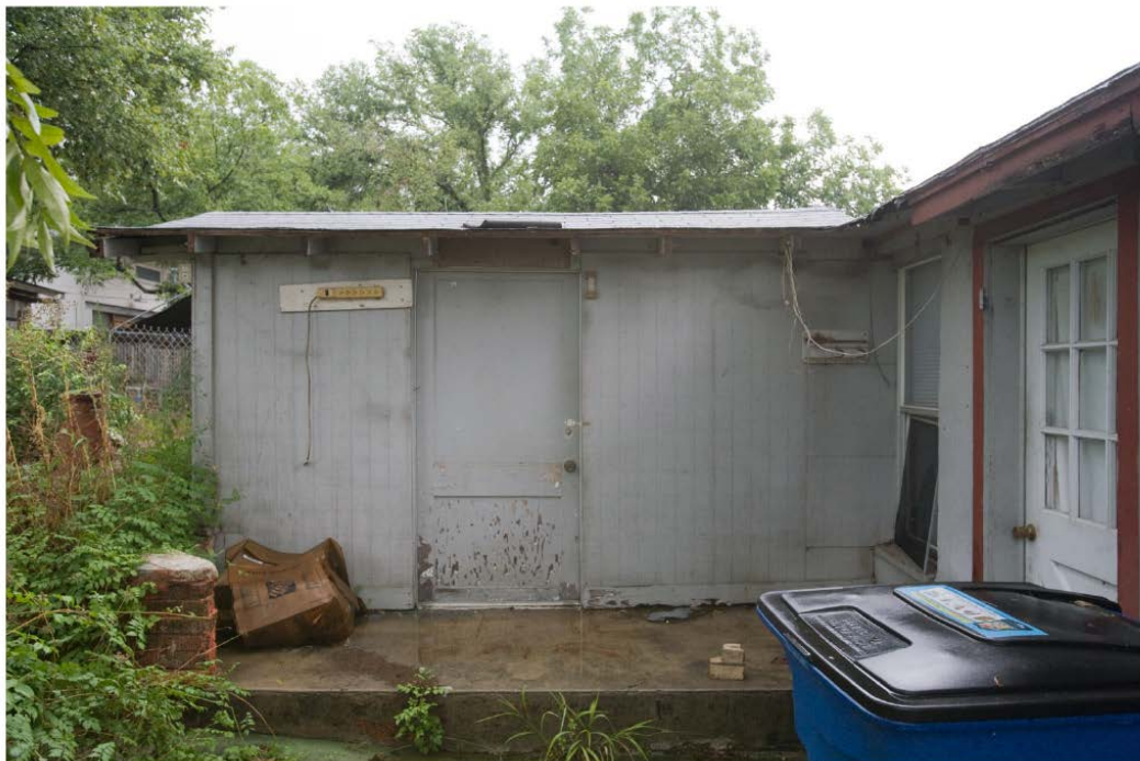
photo: July 11, 2012 location: south side. Inferior & decayed bathroom addition