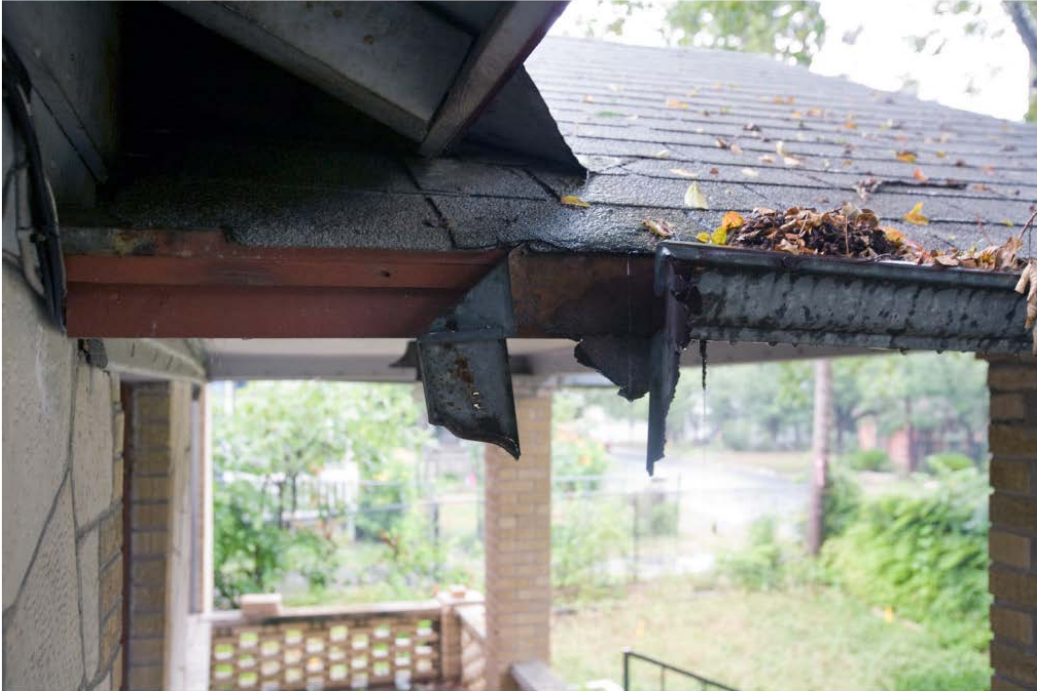
photo: July 11, 2012 location: east (street) side. The original house is in a state of decay