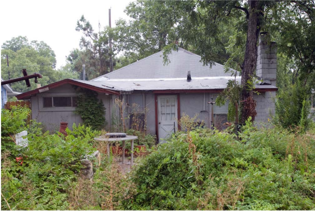
photo: July 11, 2012 location: south side. The entire rear of the house comprises later, inferior additions