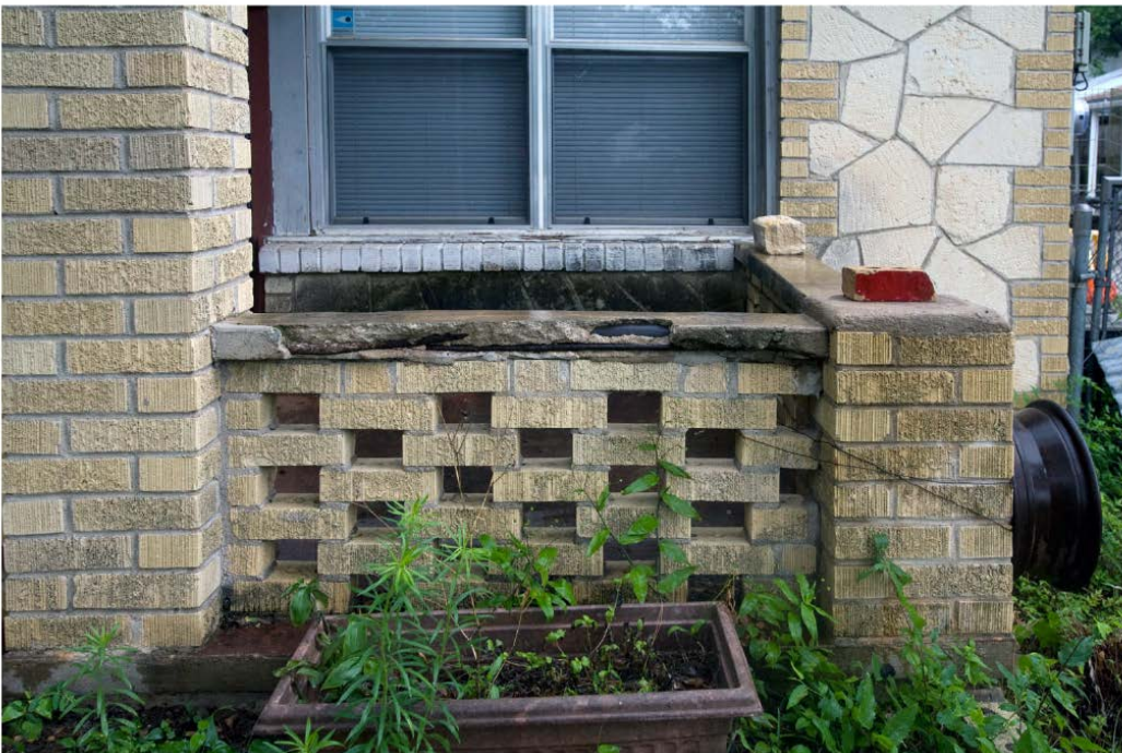
photo: July 11, 2012 location: east (street) side. The original house is in a state of decay