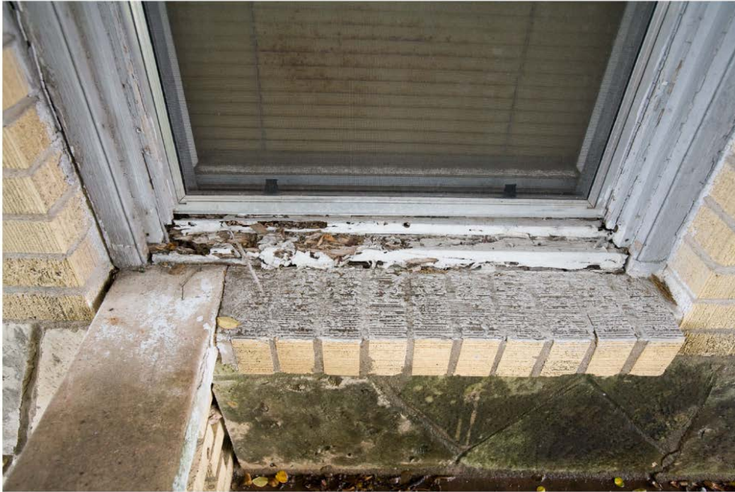
photo: July 11, 2012 location: east (street) side. The original house is in a state of decay. There is pervasive dry-rot at windows