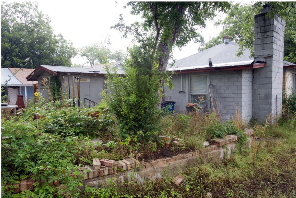
photo: July 11, 2012 location: southwest side. The entire rear of the house comprises later, inferior additions