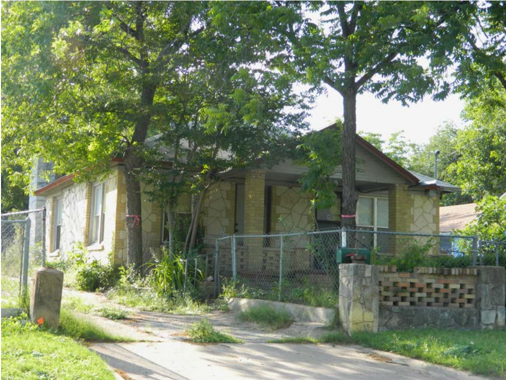
2212 S. 3 rd Street ca. 1946