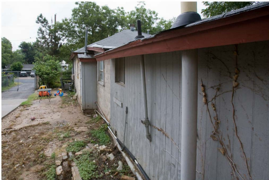
photo: July 11, 2012 location: north side. 2/3 of the north facade comprises later, inferior additions