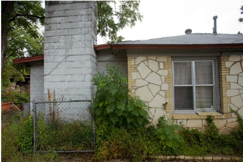
photo: July 11, 2012 location: south side. Joint between original construction and additions