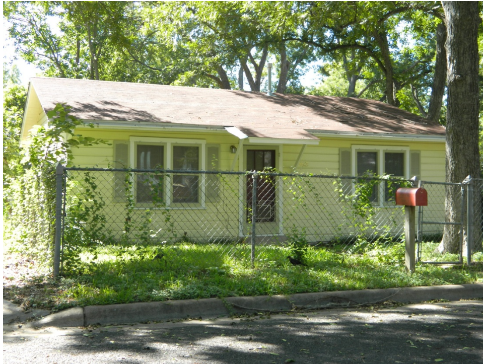
4605 Avenue C ca. 1951