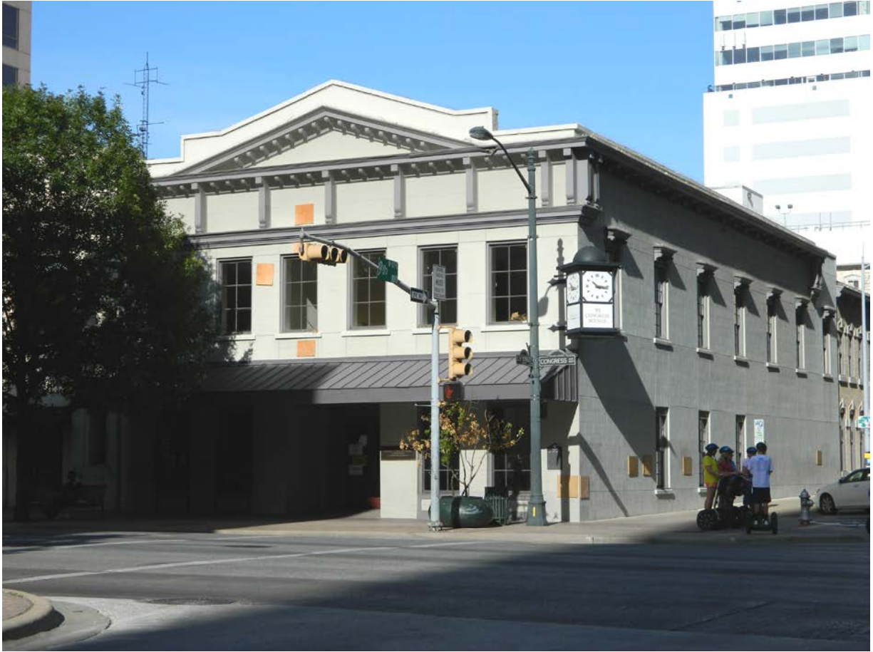
The existing building at 901 Congress Avenue