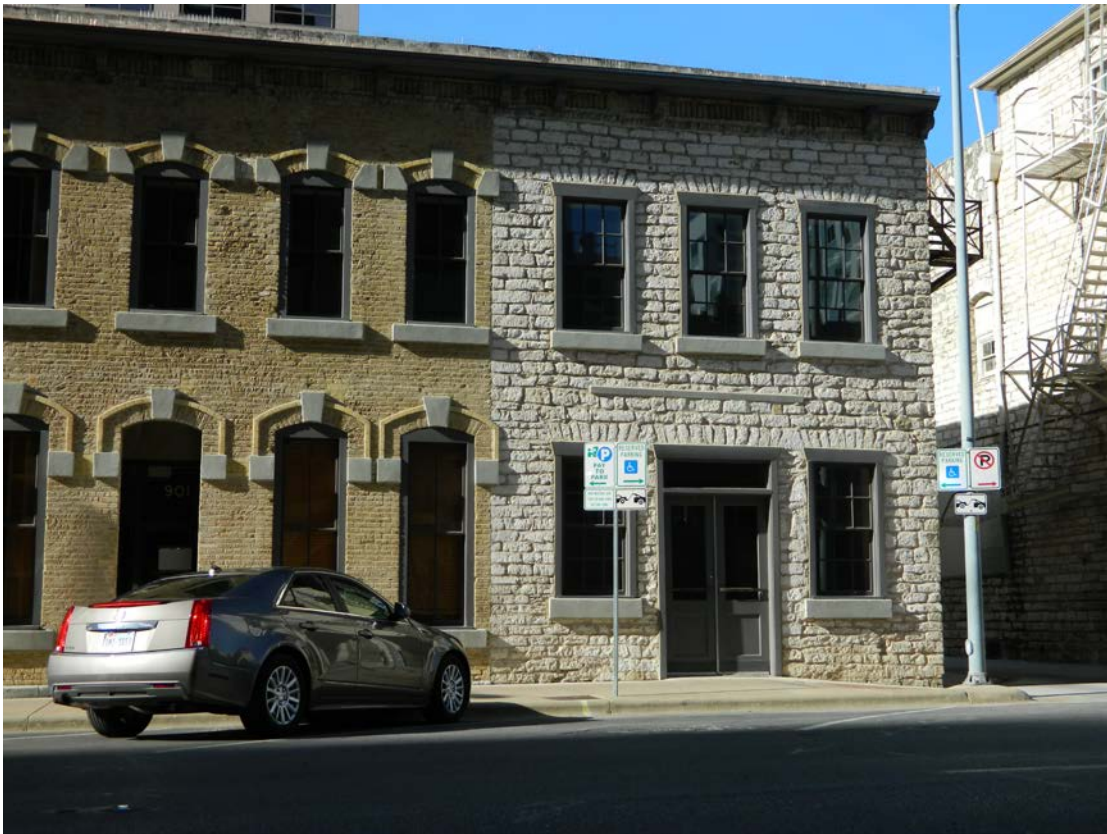
These buildings facing E. 9 th Street will be incorporated into the new building.