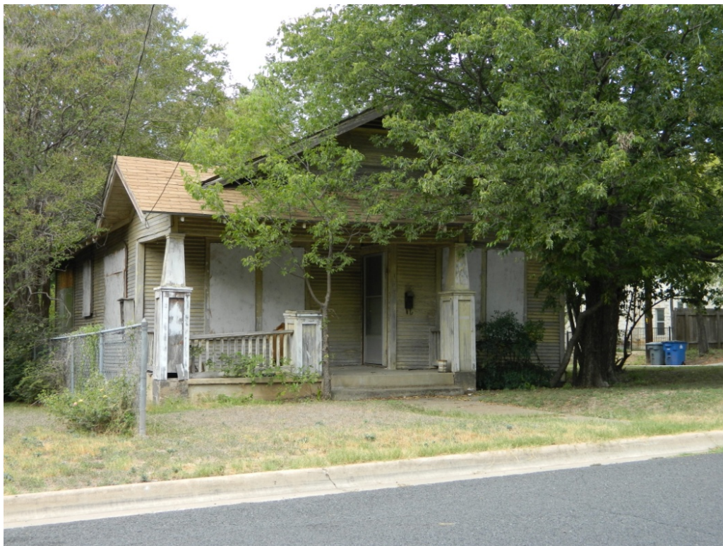
4532 Avenue F ca. 1930