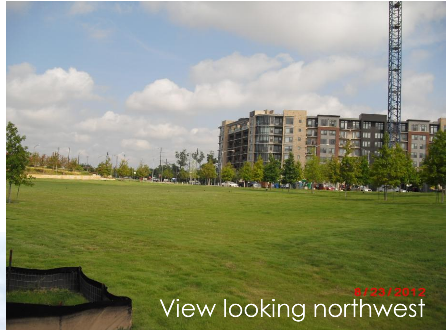
View looking northwest

City proposing to extend water quality reirrigation system to open field south of Gables Park Plaza