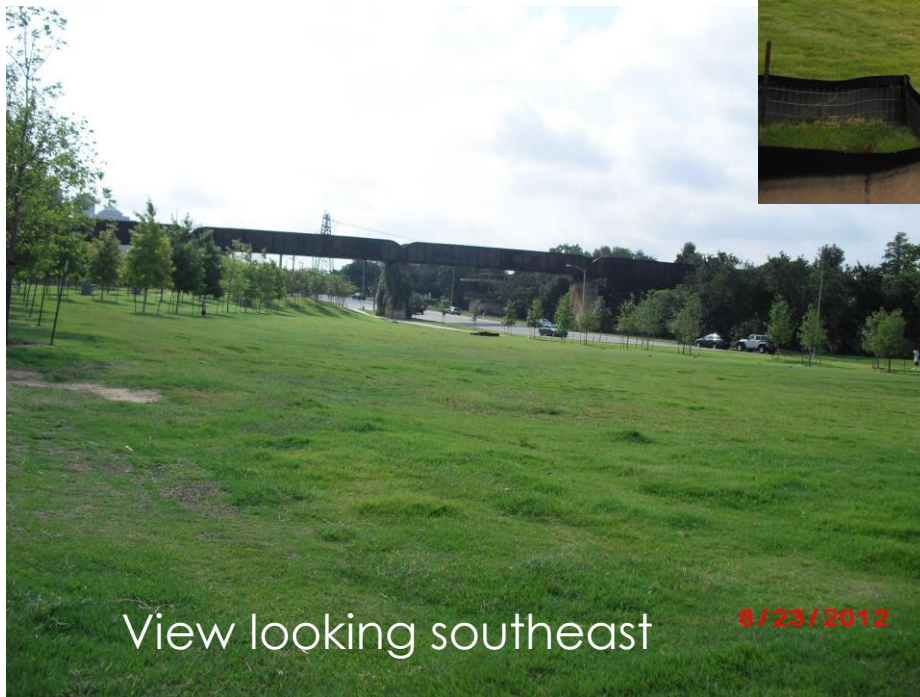
View looking southeast