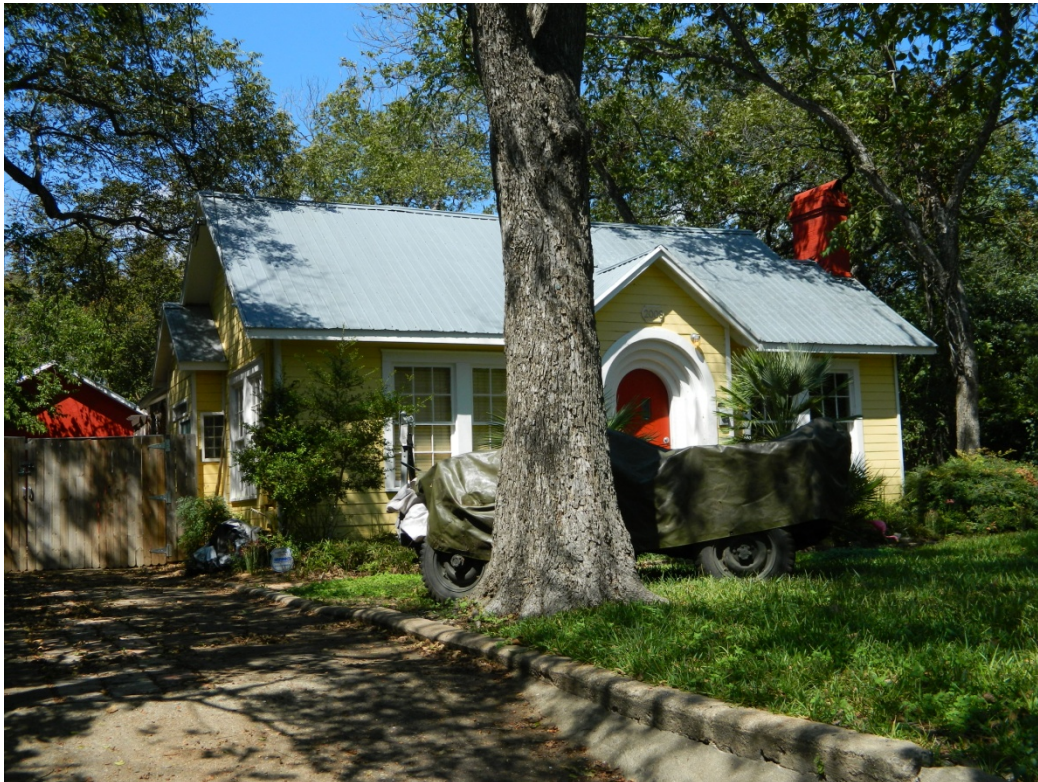
2008 Goodrich Avenue ca. 1939